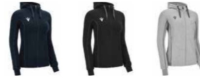
0700 NAVY/LIGHT NAVY 0900 BLACK/ANTHRACITE 1900 GREY MELANGE/ANTHRACITE