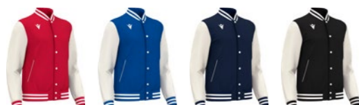
0239 RED/OFF WHITE ROSSO/OFF WHITE 0339 ROYAL BLUE/OFF WHITE BLU ROYAL/OFF WHITE 0739 NAVY/OFF WHITE NAVY/OFF WHITE 0939 BLACK/OFF WHITE NERO/OFF WHITE