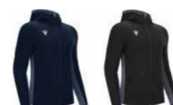
0700 NAVY LIGHT NAVY NAVY NAVY CHIARO 0928 BLACK ANTHRACITE NERO ANTRACITE