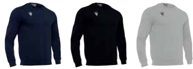
07 NAVY 09 BLACK 19 GREY