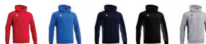
0200 RED/DARK RED ROSSO/ROSSO SCURO 0300 ROYAL BLUE/DARK ROYAL BLUE BLU ROYAL/BLU ROYAL SCURO 0700 NAVY/LIGHT NAVY NAVY/NAVY CHIARO 0928 BLACK/ANTHRACITE NERO/ANTRACITE 1928 GREY MELANGE/ANTHRACITE GRIGIO MELANGE/ANTRACITE