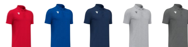
0200 RED/MELANGE ROSSO/MELANGE 0300 ROYAL BLUE/MELANGE BLU ROYAL/MELANGE 0700 NAVY/MELANGE NAVY/MELANGE 1900 GREY/MELANGE GRIGIO/MELANGE 2800 ANTHRACITE/MELANGE ANTRACITE/MELANGE