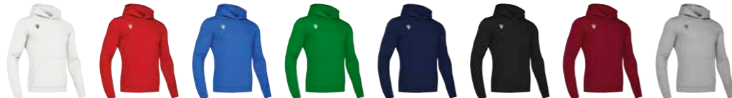
01 WHITE 02 RED 03 ROYAL BLUE 04 GREEN 07 NAVY 09 BLACK 14 CARDINAL 19 GREY