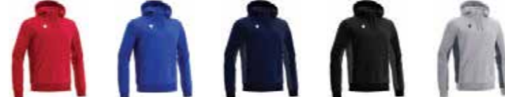
0200 RED/DARK RED 0300 ROYAL BLUE/DARK ROYAL BLUE 0700 NAVY/LIGHT NAVY 0928 BLACK/ANTHRACITE 1928 GREY MELANGE/ANTHRACITE