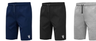
0700 NAVY NAVY 0900 BLACK NERO 1900 GREY MELANGE GRIGIO MELANGE