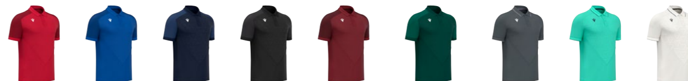
0200 RED/DARK RED ROSSO/ROSSO SCURO 0300 ROYAL BLUE/DARK ROYAL BLUE BLU ROYAL/BLU ROYAL SCURO 0700 NAVY/LIGHT NAVY NAVY/NAVY CHIARO 0900 BLACK/DARK GREY NERO/GRIGIO SCURO 1400 CARDINAL/DARK CARDINAL GRANATA/GRANATA SCURO 1700 BOTTLE GREEN/LIGHT BOTTLE GREEN VERDE BOTTIGLIA/VERDE BOTTIGLIA CHIARO 2840 ANTHRACITE/LILAC ANTRACITE/LILLA 3807 TURQUOISE/NAVY TURCHESE/NAVY 3928 OFF WHITE/ANTHRACITE OFF WHITE/ANTRACITE