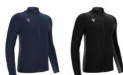
0700 NAVY LIGHT NAVY NAVY NAVY CHIARO 0928 BLACK ANTHRACITE NERO ANTRACITE