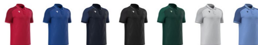
0201 RED/WHITE ROSSO/BIANCO 0301 ROYAL BLUE/WHITE BLU ROYAL/BIANCO 0701 NAVY/WHITE NAVY/BIANCO 0901 BLACK/WHITE NERO/BIANCO 1744 BOTTLE GREEN/MINT VERDE BOTTIGLIA/MENTA 4228 STONE GREY/ANTHRACITE GRIGIO PIETRA/ANTRACITE 4307 INDIGO SKY/NAVY CELO INDACO/NAVY