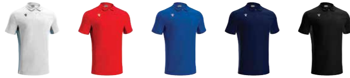
0123 WHITE/SILVER BIANCO/ARGENTO 0200 RED/DARK RED ROSSO/ROSSO SCURO 0300 ROYAL BLUE/DARK ROYAL BLUE BLU ROYAL/BLU ROYAL SCURO 0700 NAVY/LIGHT NAVY NAVY/NAVY CHIARO 0928 BLACK/ANTHRACITE NERO/ANTRACITE