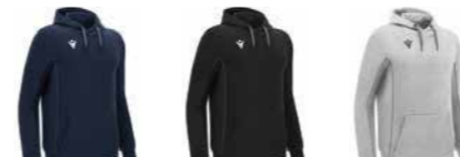
0700 NAVY/LIGHT NAVY 0900 BLACK/ANTHRACITE 1900 GREY MELANGE/ANTHRACITE

*Size S is a Senior size. *La taglia S è una taglia Senior.