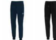
07 NAVY 09 BLACK