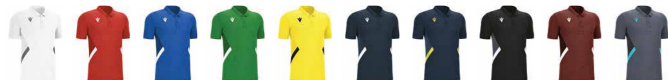
0128 WHITE/ANTHRACITE BIANCO/ANTRACITE 0201 RED/WHITE ROSSO/BIANCO 0301 ROYAL BLUE/WHITE BLU ROYAL/BIANCO 0401 GREEN/WHITE VERDE/BIANCO 0509 YELLOW/BLACK GIALL/NERO 0701 NAVY/WHITE NAVY/BIANCO 0705 NAVY/YELLOW NAVY/GIALLO 0901 BLACK/WHITE NERO/BIANCO 1401 CARDINAL/WHITE GRANATA/BIANCO 3728 ANTHRACITE/NEON SKY ANTRACITE/CELESTE FLUO