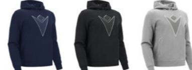
0700 NAVY 0900 BLACK 1900 GREY