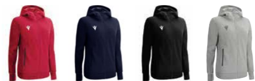
02 RED 07 NAVY 09 BLACK 19 GREY MELANGE