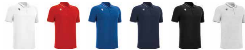
0100 WHITE BIANCO 0200 RED ROSSO 0300 ROYAL BLUE BLU ROYAL 0700 NAVY NAVY 0900 BLACK NERO 1900 GREY MELANGE GRIGIO MELANGE