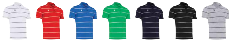
0128 WHITE/ANTHRACITE BIANCO/ANTRACITE 0201 RED/WHITE ROSSO/BIANCO 0301 ROYAL BLUE/WHITE BLU ROYAL/BIANCO 0401 GREEN/WHITE VERDE/BIANCO 0701 NAVY/WHITE NAVY/BIANCO 0901 BLACK/WHITE NERO/BIANCO 1928 GREY/ANTHRACITE GRIGIO/ANTRACITE