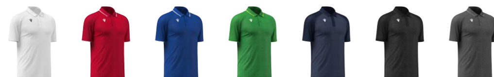
0123 WHITE/SILVER BIANCO/ARGENTO 0201 RED/WHITE ROSSO/BIANCO 0301 ROYAL BLUE/WHITE BLU ROYAL/BIANCO 0416 GREEN/NEON GREEN VERDE/VERDE FLUO 0700 NAVY/LIGHT NAVY NAVY/NAVY CHIARO 0900 BLACK/DARK ANTHRACITE NERO/ANTRACITE SCURO 2800 ANTHRACITE ANTRACITE