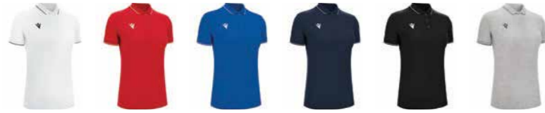
0100 WHITE 0200 RED 0300 ROYAL BLUE 0700 NAVY 0900 BLACK 1900 GREY MELANGE