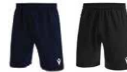
07 NAVY NAVY 09 BLACK NERO