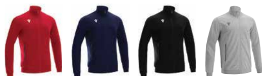
02 RED ROSSO 07 NAVY NAVY 09 BLACK NERO 19 GREY MELANGE GRIGIO MELANGE