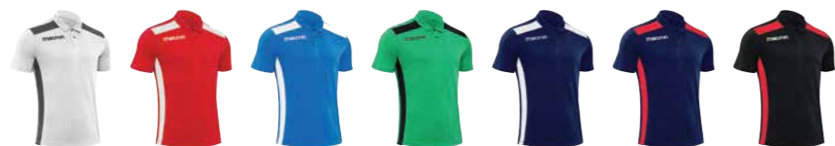
0128 WHITE/ANTHRACITE BIANCO/ANTRACITE 0201 RED/WHITE ROSSO/BIANCO 0301 ROYAL BLUE/WHITE BLU ROYAL/BIANCO 0409 GREEN/BLACK VERDE/NERO 0701 NAVY/WHITE NAVY/BIANCO 0702 NAVY/RED NAVY/ROSSO 0902 BLACK/RED NERO/ROSSO