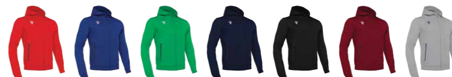
02 RED ROSSO 03 ROYAL BLUE BLU ROYAL 04 GREEN VERDE 07 NAVY NAVY 09 BLACK NERO 14 CARDINAL GRANATA 19 GREY GRIGIO