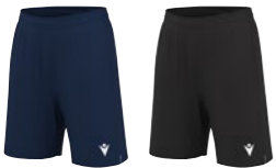
0700 NAVY 0900 BLACK