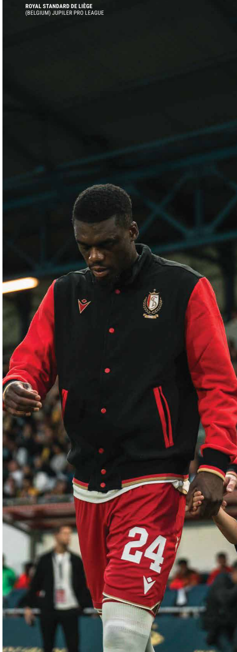
ROYAL STANDARD DE LIÈGE (BELGIUM) JUPIILER PRO LEAGUE