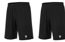
0700 NAVY NAVY 0900 BLACK NERO