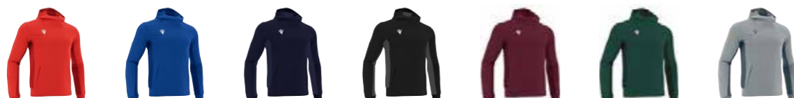
02 RED/DARK RED 03 ROYAL BLUE/DARK ROYAL BLUE 07 NAVY/LIGHT NAVY 09 BLACK/ANTHRACITE 14 CARDINAL/DARK CARDINAL 17 BOTTLE GREEN/LIGHT BOTTLE GREEN 23 SILVER/DARK SILVER