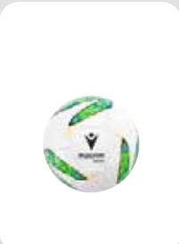
KELVIN mini ball SIZE: N.0