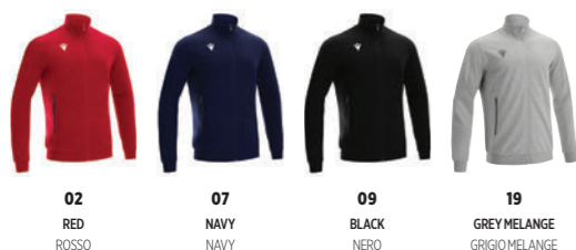
02 RED ROSSO 07 NAVY NAVY 09 BLACK NERO 19 GREY MELANGE GRIGIO MELANGE