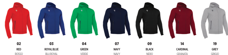
02 RED ROSSO 03 ROYAL BLUE BLUROYAL 04 GREEN VERDE 07 NAVY NAVY 09 BLACK NERO 14 CARDINAL GRANATA 19 GREY GRIGIO