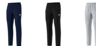
07 NAVY NAVY 09 BLACK NERO 19 GREY GRIGIO