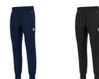
07 NAVY NAVY 09 BLACK NERO