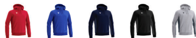
0200 RED/DARK RED ROSSO/ROSSO SCURO 0300 ROYAL BLUE/DARK ROYAL BLUE BLU ROYAL/BLU ROYAL SCURO 0700 NAVY/LIGHT NAVY NAVY/NAVY CHIARO 0928 BLACK/ANTHRACITE NERO/ANTRACITE 1928 GREY MELANGE/ANTHRACITE GRIGIO MELANGE/ANTRACITE