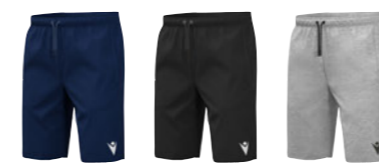
0700 NAVY NAVY 0900 BLACK NERO 1900 GREYMELANGE GRIGIO MELANGE