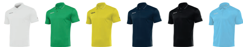
0119 WHITE/GREY BIANCO/GRIGIO 0401 GREEN/WHITE VERDE/BIANCO 0501 YELLOW/WHITE GIALLO/BIANCO 0701 NAVY/WHITE NAVY/BIANCO 0901 BLACK/WHITE NERO/BIANCO 1001 COLUMBIA/WHITE CELESTE/BIANCO