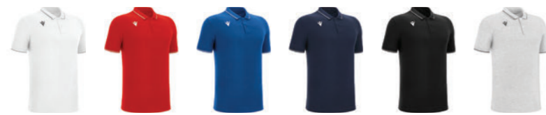
0100 WHITE BIANCO 0200 RED ROSSO 0300 ROYAL BLUE BLU ROYAL 0700 NAVY NAVY 0900 BLACK NERO 1900 GREYMELANGE GRIGIO MELANGE