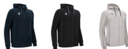
0700 NAVY/LIGHT NAVY NAVY/NAVY CHIARO 0928 BLACK/ANTHRACITE NERO/ANTRACITE 1928 GREY MELANGE/ANTHRACITE GRIGIO MELANGE/ANTRACITE