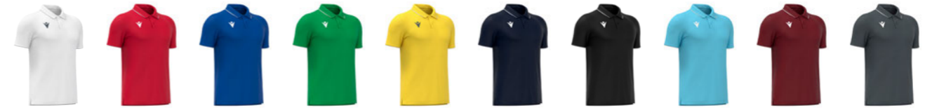
0119 WHITE/GREY BIANCO/GRIGIO 0201 RED/WHITE ROSSO/BIANCO 0301 ROYAL BLUE/WHITE BLU ROYAL/BIANCO 0401 GREEN/WHITE VERDE/BIANCO 0501 YELLOW/WHITE GIALLO/BIANCO 0701 NAVY/WHITE NAVY/BIANCO 0901 BLACK/WHITE NERO/BIANCO 1001 COLUMBIA/WHITE CELESTE/BIANCO 1401 CARDINAL/WHITE GRANATA/BIANCO 2801 ANTHRACITE/WHITE ANTRACITE/BIANCO