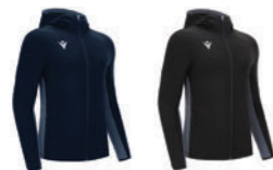
0700 NAVY/LIGHT NAVY NAVY/NAVY CHIARO 0928 BLACK/ANTHRACITE NERO/ANTRACITE