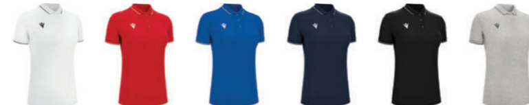
0100 WHITE BIANCO 0200 RED ROSSO 0300 ROYAL BLUE BLU ROYAL 0700 NAVY NAVY 0900 BLACK NERO 1900 GREY MELANGE GRIGIO MELANGE