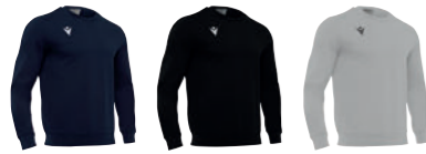
07 NAVY NAVY 09 BLACK NERO 19 GREY GRIGIO