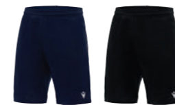
0701 NAVY/WHITE NAVY/BIANCO 0901 BLACK/WHITE NERO/BIANCO