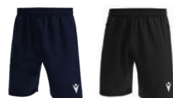
07 NAVY NAVY 09 BLACK NERO