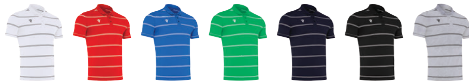
0128 WHITE/ANTHRACITE BIANCO/ANTRACITE 0201 RED/WHITE ROSSO/BIANCO 0301 ROYAL BLUE/WHITE BLU ROYAL/BIANCO 0401 GREEN/WHITE VERDE/BIANCO 0701 NAVY/WHITE NAVY/BIANCO 0901 BLACK/WHITE NERO/BIANCO 1928 GREY/ANTHRACITE GRIGIO/ANTRACITE