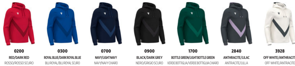
0200 RED/DARK RED ROSSO/ROSSO SCURO 0300 ROYAL BLUE/DARK ROYAL BLUE BLUROYAL/BLUROYAL SCURO 0700 NAVY/LIGHT NAVY NAVY/NAVY CHIARO 0900 BLACK/DARK GREY NERO/GRIGIO SCURO 1700 BOTTLE GREEN/LIGHT BOTTLE GREEN VERDE BOTTIGLIA/VERDE BOTTIGLIA CHIARO 2840 ANTHRACITE/LILAC ANTRACITE/LILLA 3928 OFF WHITE/ANTHRACITE OFF WHITE/ANTRACITE