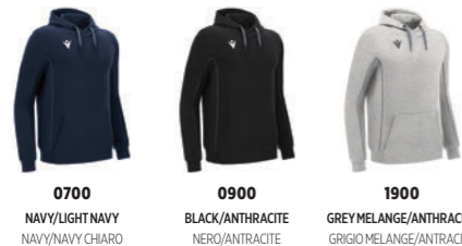
0700 NAVY/LIGHT NAVY NAVY/NAVY CHIARO 0900 BLACK/ANTHRACITE NERO/ANTRACITE 1900 GREY MELANGE/ANTHRACITE GRIGIO MELANGE/ANTRACITE