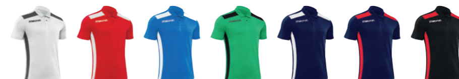
0128 WHITE/ANTHRACITE BIANCO/ANTRACITE 0201 RED/WHITE ROSSO/BIANCO 0301 ROYAL BLUE/WHITE BLU ROYAL/BIANCO 0409 GREEN/BLACK VERDE/NERO 0701 NAVY/WHITE NAVY/BIANCO 0702 NAVY/RED NAVY/ROSSO 0902 BLACK/RED NERO/ROSSO