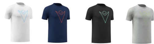
0100 WHITE BIANCO 0700 NAVY NAVY 0900 BLACK NERO 1900 GREY MELANGE GRIGIO MELANGE