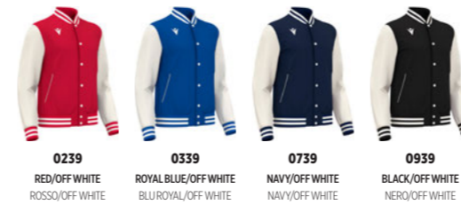
0239 RED/OFF WHITE ROSSO/OFF WHITE 0339 ROYAL BLUE/OFF WHITE BLUROYAL/OFF WHITE 0739 NAVY/OFF WHITE NAVY/OFF WHITE 0939 BLACK/OFF WHITE NERO/OFF WHITE