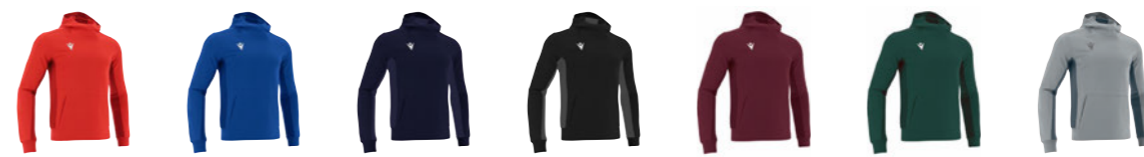
02 RED/DARK RED ROSSO/ROSSO SCURO 03 ROYAL BLUE/DARK ROYAL BLUE BLU ROYAL/BLU ROYAL SCURO 07 NAVY/LIGHT NAVY NAVY/NAVY CHIARO 09 BLACK/ANTHRACITE NERO/ANTRACITE 14 CARDINAL/DARK CARDINAL GRANATA/GRANATA SCURO 17 BOTTLE GREEN/LIGHT BOTTLE GREEN VERDE BOTTIGLIA/VERDE BOTTIGLIA CHIARO 23 SILVER/DARK SILVER ARGENTO/ARGENTO SCURO