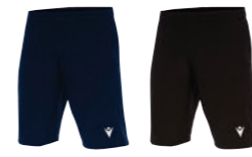
07 NAVY NAVY 09 BLACK NERO