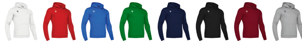
01 WHITE BIANCO 02 RED ROSSO 03 ROYAL BLUE BLU ROYAL 04 GREEN VERDE 07 NAVY NAVY 09 BLACK NERO 14 CARDINAL GRANATA 19 GREY GRIGIO