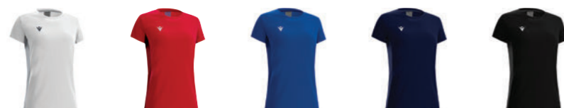
0123 WHITE/SILVER BIANCO/ARGENTO 0200 RED/DARK RED ROSSO/ROSSO SCURO 0300 ROYAL BLUE/DARK ROYAL BLUE BLU ROYAL/BLU ROYAL SCURO 0700 NAVY/LIGHT NAVY NAVY/NAVY CHIARO 0928 BLACK/ANTHRACITE NERO/ANTRACITE