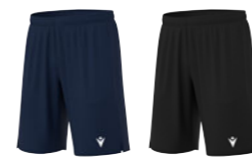
0700 NAVY NAVY 0900 BLACK NERO