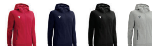
02 RED ROSSO 07 NAVY NAVY 09 BLACK NERO 19 GREY MELANGE GRIGIO MELANGE