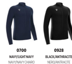
0700 NAVY/LIGHT NAVY NAVY/NAVY CHIARO 0928 BLACK/ANTHRACITE NERO/ANTRACITE