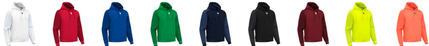
0100 WHITE/LIGHT GREY BIANCO/GRIGIO CHIARO 0200 RED/DARK RED ROSSO/ROSSO SCURO 0300 ROYAL BLUE/DARK ROYAL BLUE BLU ROYAL/BLU ROYAL SCURO 0400 GREEN/DARK GREEN VERDE/VERDE SCURO 0700 NAVY/LIGHT NAVY NAVY/NAVY CHIARO 0900 BLACK/DARK GREY NERO/GRIGIO SCURO 1400 CARDINAL/DARK CARDINAL GRANATA/GRANATA SCURO 1500 NEON YELLOW/DARK NEON YELLOW GIALLO FLUO/GIALLO FLUO SCURO 2100 NEON CORAL/DARK NEON CORAL CORALLO FLUO/CORALLO FLUO SCURO