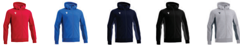
0200 RED/DARK RED ROSSO/ROSSO SCURO 0300 ROYAL BLUE/DARK ROYAL BLUE BLU ROYAL/BLU ROYAL SCURO 0700 NAVY/LIGHT NAVY NAVY/NAVY CHIARO 0928 BLACK/ANTHRACITE NERO/ANTRACITE 1928 GREY MELANGE/ANTHRACITE GRIGIO MELANGE/ANTRACITE