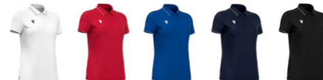
0119 WHITE/GREY BIANCO/GRIGIO 0201 RED/WHITE ROSSO/BIANCO 0301 ROYAL BLUE/WHITE BLU ROYAL/BIANCO 0701 NAVY/WHITE NAVY/BIANCO 0901 BLACK/WHITE NERO/BIANCO