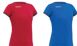
0201 RED/WHITE ROSSO/BIANCO 0301 ROYAL BLUE/WHITE BLU ROYAL/BIANCO