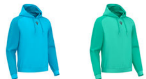
3700 NEON SKY/DARK NEON SKY CELESTE FLUO/CELESTE FLUO SCURO 3800 TURQUOISE/DARK TURQUOISE TURCHESE/TURCHESE SCURO