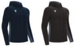
0700 NAVY/LIGHT NAVY NAVY/NAVY CHIARO 0928 BLACK/ANTHRACITE NERO/ANTRACITE