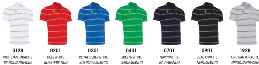
0128 WHITE/ANTHRACITE BIANCO/ANTRACITE 0201 RED/WHITE ROSSO/BIANCO 0301 ROYAL BLUE/WHITE BLU ROYAL/BIANCO 0401 GREEN/WHITE VERDE/BIANCO 0701 NAVY/WHITE NAVY/BIANCO 0901 BLACK/WHITE NERO/BIANCO 1928 GREY/ANTHRACITE GRIGIO/ANTRACITE