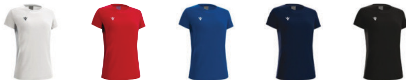
0123 WHITE/SILVER BIANCO/ARGENTO