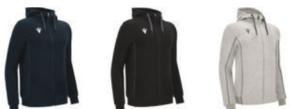
0700 NAVY/LIGHT NAVY NAVY/NAVY CHIARO 0928 BLACK/ANTHRACITE NERO/ANTRACITE 1928 GREY MELANGE/ANTHRACITE GRIGIO MELANGE/ANTRACITE

*Size S is a Senior size. *La taglia S è una taglia Senior.