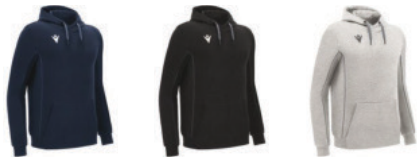
0700 NAVY/LIGHT NAVY NAVY/NAVY CHIARO 0900 BLACK/ANTHRACITE NERO/ANTRACITE 1900 GREY MELANGE/ANTHRACITE GRIGIO MELANGE/ANTRACITE

*Size S is a Senior size. *La taglia S è una taglia Senior.