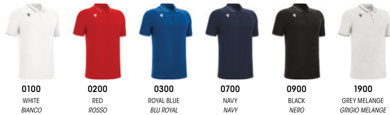
0100 WHITE BIANCO 0200 RED ROSSO 0300 ROYAL BLUE BLU ROYAL 0700 NAVY NAVY 0900 BLACK NERO 1900 GREY MELANGE GRIGIO MELANGE