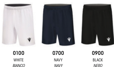
0100 WHITE BIANCO 0700 NAVY NAVY 0900 BLACK NERO