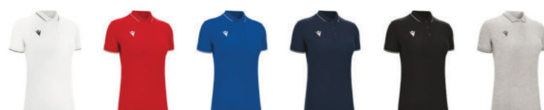
0100 WHITE BIANCO