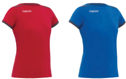
0201 RED/WHITE ROSSO/BIANCO